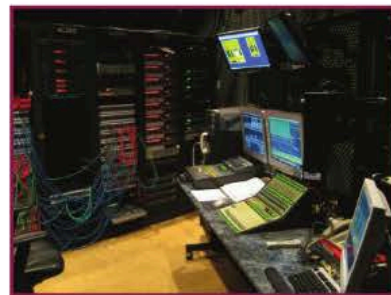
The backstage technical area housed a Meyer LCS CueConsole control surface and Matrix3 mixing system for monitoring.